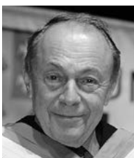
MICHEL ROCARD Writer and French politician Honorary doctor