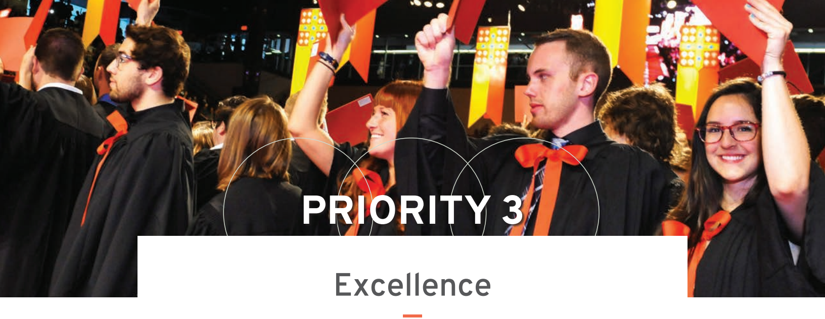
Objective 3.1: Work in networks, not silos