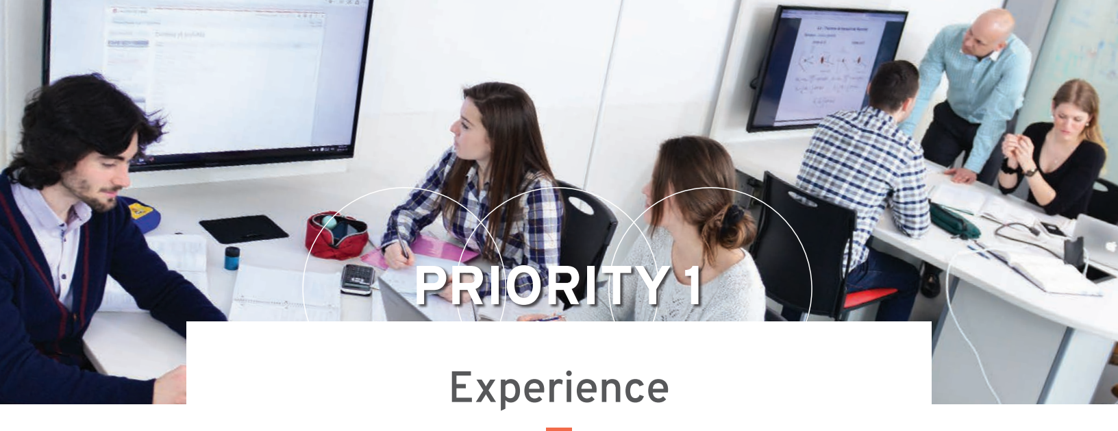
Objective 1.1: Enrich the student experience