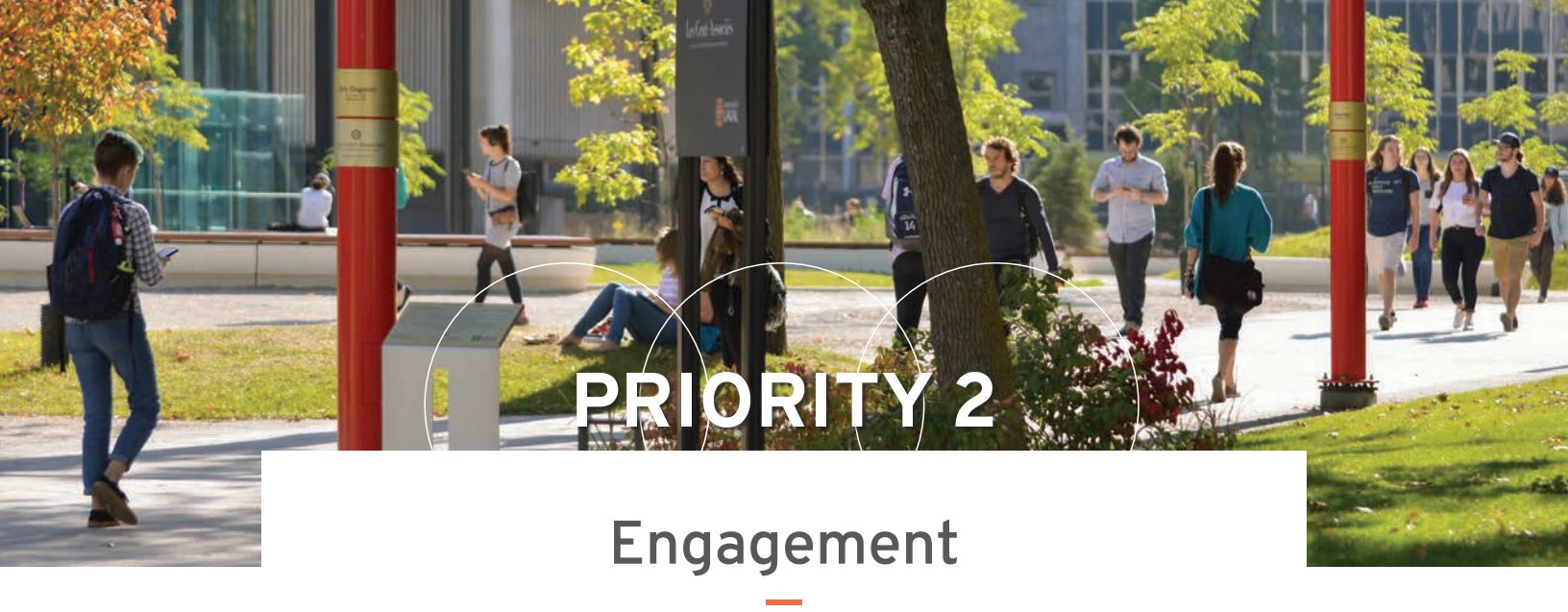
Objective 2.1: Be engaged for the well-being of society